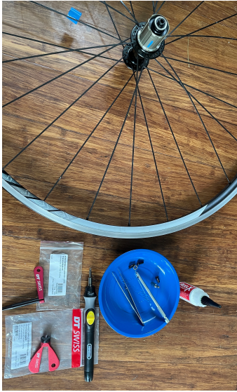
Tools of trade