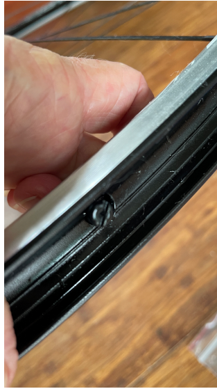
Removing nipple that hold the spoke