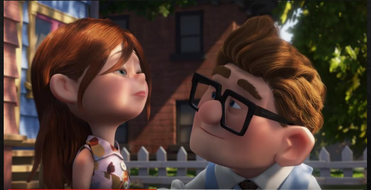
Still from Pixar and Disney “Up”, 2009